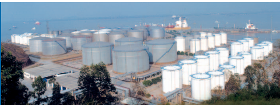
Storage Tank Farm of Xiao Hu Island Terminal